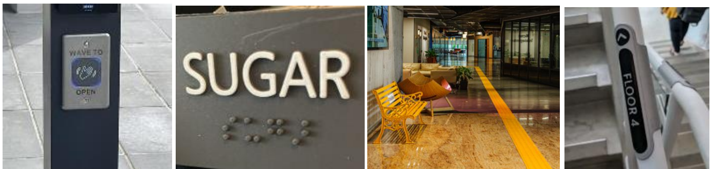
Left to right: Wave to open door entry; high contrast, braille signage in kitchenettes; high contrast, tactile floor and railing markers

Microsoft's India offices have set new benchmarks for accessibility by integrating inclusive design principles throughout their campuses, ensuring spaces are welcoming and usable for people with a wide range of disabilities. The company leverages technologies like digital wayfinding, accessible entrances, and sensory-friendly features—to create environments where every employee and visitor can thrive