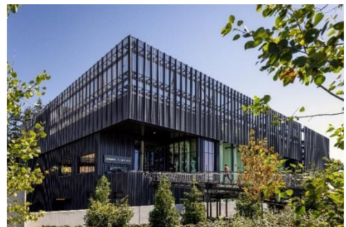
The Thermal Energy Center on Microsoft's Redmond campus.