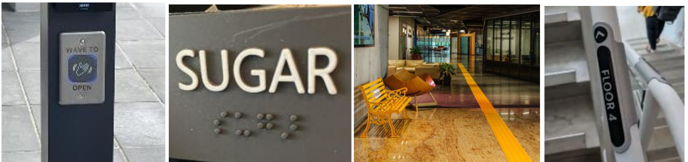
Left to right: Wave to open door entry; high contrast, braille signage in kitchenettes; high contrast, tactile floor and railing markers

Microsoft's India offices have set new benchmarks for accessibility by integrating inclusive design principles throughout their campuses, ensuring spaces are welcoming and usable for people with a wide range of disabilities. The company leverages technologies like digital wayfinding, accessible entrances, and sensory-friendly features—to create environments where every employee and visitor can thrive