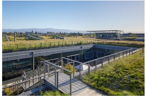
The Mountain View Campus includes a three-acre green roof, which attracts pollinators and birds to help encourage biodiversity.

Like Redmond, the Mountain View campus's closed-loop, water-based design combines thermal-energy storage tanks and a radiant cooling system that collects water in the evening to cool it down and then reuses the water during the day for air conditioning. The campus also includes rooftop solar arrays that offset about 20% of the campus's energy demand with the rest coming from a utility that uses 100% renewable sources.